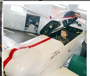
4 th floor -

Airplanes, Hot Wheels, Space Scale, Science exh., HO trains