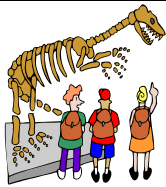
2 nd floor

LED Play Dance Floor, Dinos/Fossils, Iroquois Longhouse