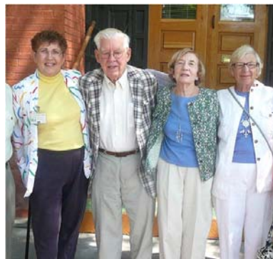
museum or on our website.

Purchase an engraved brick to add to the paved front, which continues the beautification & renovation of our historic building, and supports our community treasure. Only $75., each brick holds 3 lines, 14 characters a line. Forms are available in the